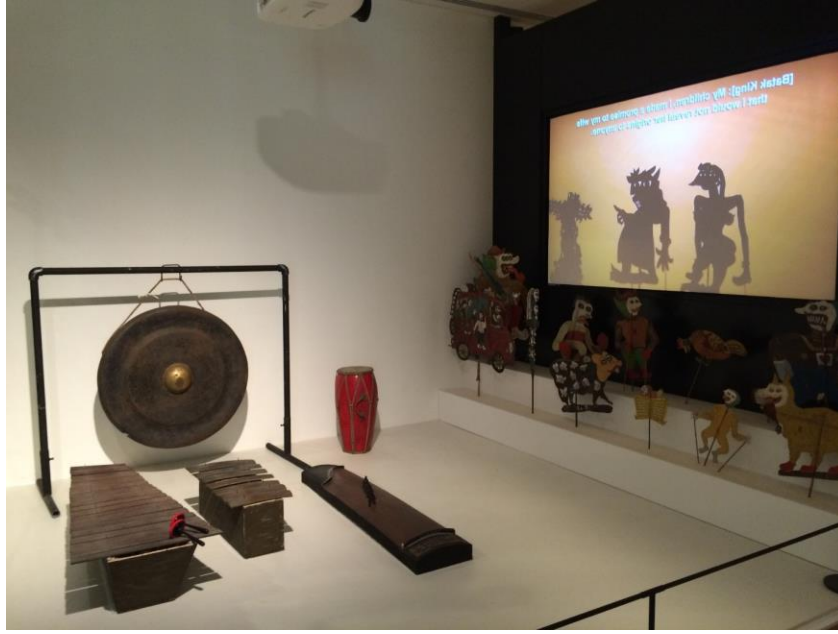
Figure 4. Heri Dono “Wayang Legenda” 1988 reconstructed for 2015 exhibit at the National Gallery Singapore. “Behind the Screen”.

Although Wayang Legenda is not as popular as wayang kulit in Indonesia today, it was a good showcase for Dono and provided inspiration to other wayang artists who wanted to copy his style. “Heri is not worried about copyright or about being copied,” reports Astri Wright (1988) then quotes Heri Dono directly,