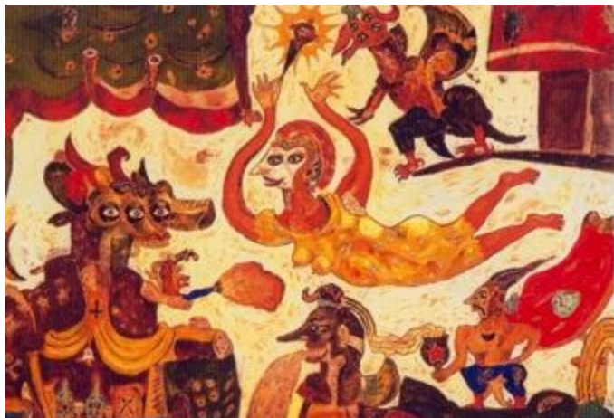
Figure 1. Performance of Wayang Beber, nd. nn. Figure 2. Interrogation (2002). A postcard made by Heri Dono and re-printed by the Western Front, Vancouver.

An unusual type of wayang that does not use puppets is wayang bèbèr . A wayang bèbèr presentation consists of unrolling a picture scroll, similar to a screen, but with sequential pictures that tell the story recited or chanted by the narrator. 80 In the Javanese