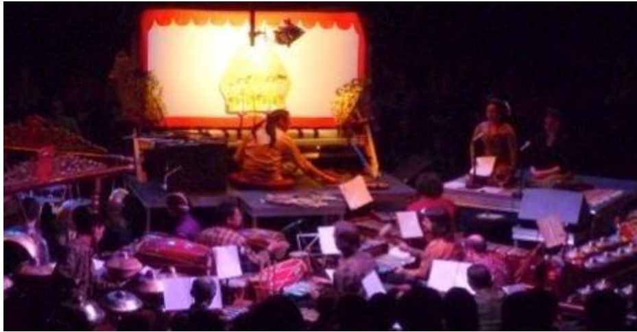
Figure 33. Matthew Isaac Cohen performed wayang in Vancouver as part of the Gong Festival (2011).