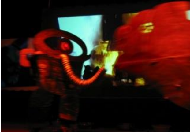
Figure 26. The life-size puppet costumes by Heri Dono (2006)

The life-size puppet costumes were worn by human actors and danced in a similar way that masks are danced by performers in traditional Javanese musical theatre. In Goro-Goro 2006, there was an interesting contrast between traditional puppet characters that had just appeared and the human sized robot (or space-suited character) and the bird puppet pictured. Compared to the traditional puppets, these seemed huge, as they also moved to musical accompaniment in front of the projected image..