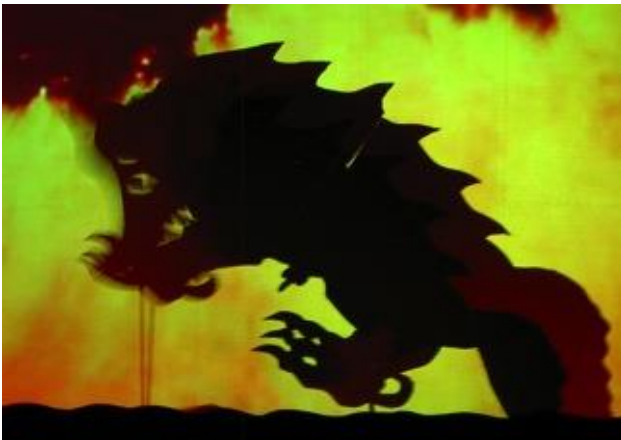
Figure 27. Dragon puppet by Heri Dono (2006)

The life-size puppet costumes were worn by human actors and danced in a similar way that masks are danced by performers in traditional Javanese musical theatre. In Goro-Goro 2006, there was an interesting contrast between traditional puppet characters that had just appeared and the human sized robot (or space-suited character) and the bird puppet pictured. Compared to the traditional puppets, these seemed huge, as they also moved to musical accompaniment in front of the projected image. (Photograph: Victoria Gibson).