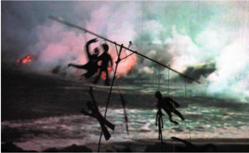
Figure 28. Tsunami and volcano by Heri Dono (2006). (Photograph: Victoria Gibson).

Finally, by using my dalang classification system Heri Dono qualifies to be included as a Type IV dalang, and I consider him as a transcultural artist because of his international reputation and blending of influences from a multiplicity of sources. After this analysis of my observations as a participant-observer, using the wahiyang theoretical framework to remain as objective as possible, I conclude that both of Heri Dono's performances in Vancouver can be classified as wahiyang gaya NA .