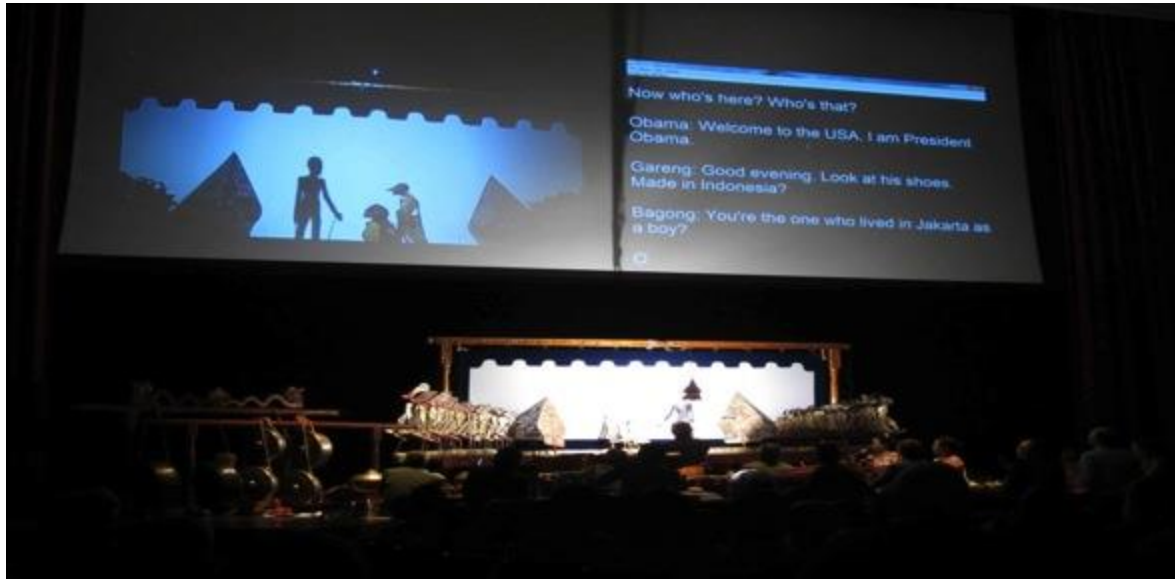
Figure 10. Projected Simultaneous Translation showing Obama Puppet, 1