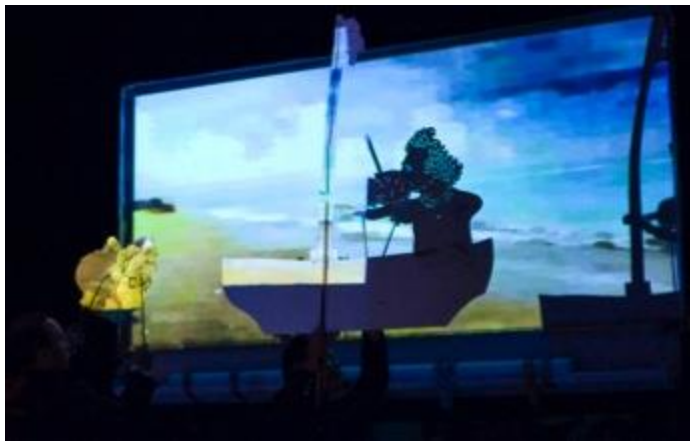
Figure 30. Semar and Einstein puppet character meet in Vancouver (2007).

Depending on the objective wahiyang theoretical framework, I examine the table where I have placed the results of my initial assessment. Semar in Lila Maya contains all four of the fundamental wayang performance components, but each of the categories contains some level of modification. Therefore, it was unlikely that this performance would be classified as authentic wayang, even though both Seno Nugroho and Eko Purnomo are Type I traditional dalang who usually ( biasa ) perform classical wayang in their home territory. Despite the modifications of and adaptations to their concept of wayang, their intention was to cooperate with the group and remain motivated to create the best show possible. The intention of the VCGS was to create an innovative performance that combined many different elements and showcased the talents of group members who played Western instruments or created computer visuals.