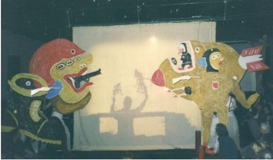
Giant-head army puppets facing each other in front of the screen, one with three eyes plus a gun in the mouth, and the other with an arrow-bomb. (Photograph: Don Chow).