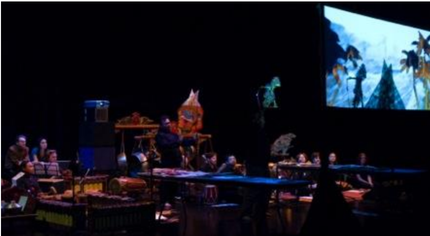
Figure 31. Semar in Lila Maya (2008)

usually move to view it from different perspectives. In the usual Indonesian staging method, the gamelan orchestra and dalang are behind the screen, but the quick movements of the dalang when changing and showing wayang puppets, their interaction with the gamelan and the vivid costumes, energetic playing and quick response of the musicians to the cues of the dalang are favourite parts of the show, but usually hidden from the view of North American seated viewers.