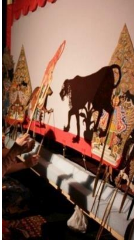
Wayang kulit stage made of floral foam instead of banana log ( gedebog ) used at the bottom of wayang screen ( kelir ) with simple wooden frame (2010). This kind of simple kelir is often used in North America.