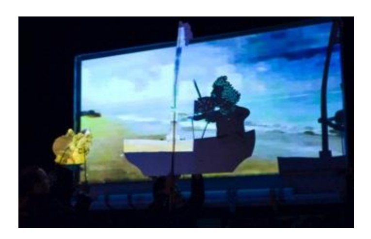
Figure 30. Semar and Einstein puppet character meet in Vancouver (2007).

Depending on the objective wahiyang theoretical framework, I examine the table where I have placed the results of my initial assessment. Semar in Lila Maya contains all four of the fundamental wayang performance components, but each of the categories contains some level of modification. Therefore, it was unlikely that this performance would be classified as authentic wayang, even though both Seno Nugroho and Eko Purnomo are Type I traditional dalang who usually ( biasa ) perform classical wayang in their home territory. Despite the modifications of and adaptations to their concept of wayang, their intention was to cooperate with the group and remain motivated to create the best show possible. The intention of the VCGS was to create an innovative performance that combined many different elements and showcased the talents of group members who played Western instruments or created computer visuals.