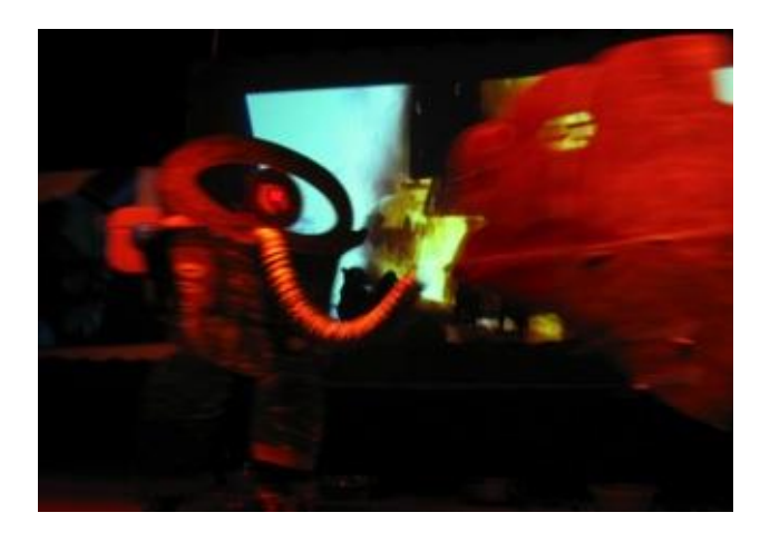
Figure 26. The life-size puppet costumes by Heri Dono (2006)

The life-size puppet costumes were worn by human actors and danced in a similar way that masks are danced by performers in traditional Javanese musical theatre. In Goro-Goro 2006, there was an interesting contrast between traditional puppet characters that had just appeared and the human sized robot (or space-suited character) and the bird puppet pictured. Compared to the traditional puppets, these seemed huge, as they also moved to musical accompaniment in front of the projected image.