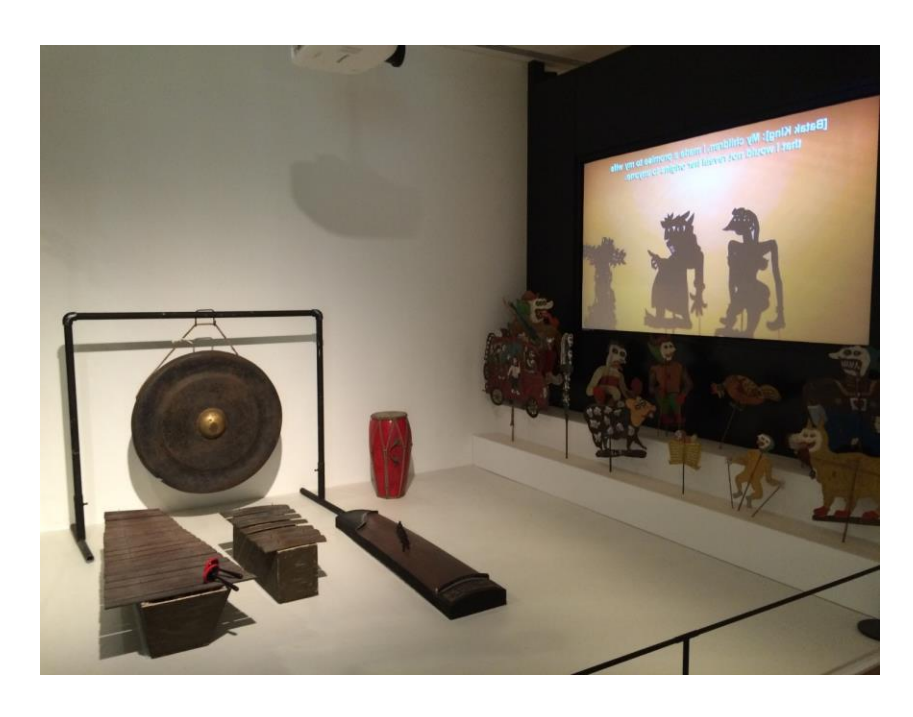
Figure 4. Heri Dono "Wayang Legenda" 1988 reconstructed for 2015 exhibit at the National Gallery Singapore. "Behind the Screen".

Although Wayang Legenda is not as popular as wayang kulit in Indonesia today, it was a good showcase for Dono and provided inspiration to other wayang artists who wanted to copy his style. "Heri is not worried about copyright or about being copied," reports Astri Wright (1988) then quotes Heri Dono directly,