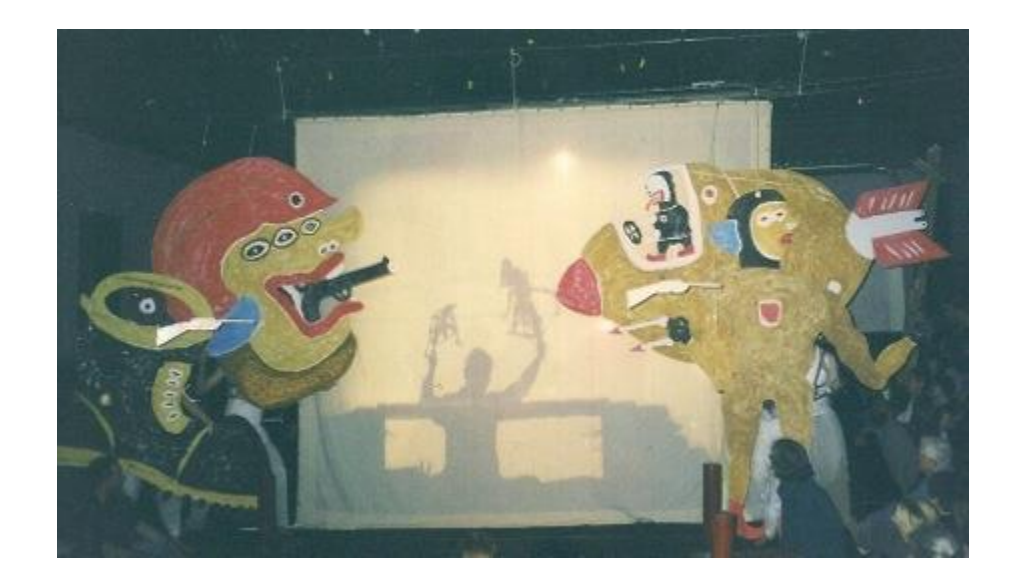
Giant-head army puppets facing each other in front of the screen, one with three eyes plus a gun in the mouth, and the other with an arrow-bomb.