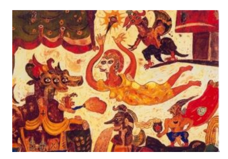
Figure 1. Performance of Wayang Beber, nd. nn. Figure 2. Interrogation (2002). A postcard made by Heri Dono and re-printed by the Western Front, Vancouver.

An unusual type of wayang that does not use puppets is wayang bèbèr. A wayang bèbèr presentation consists of unrolling a picture scroll, similar to a screen, but with sequential pictures that tell the story recited or chanted by the narrator.<sup>80</sup> In the Javanese