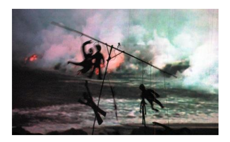
Figure 28. Tsunami and volcano by Heri Dono (2006). (Photograph: Victoria Gibson).

Finally, by using my dalang classification system Heri Dono qualifies to be included as a Type IV dalang, and I consider him as a transcultural artist because of his international reputation and blending of influences from a multiplicity of sources. After this analysis of my observations as a participant-observer, using the wahiyang theoretical framework to remain as objective as possible, I conclude that both of Heri Dono's performances in Vancouver can be classified as wahiyang gaya NA .