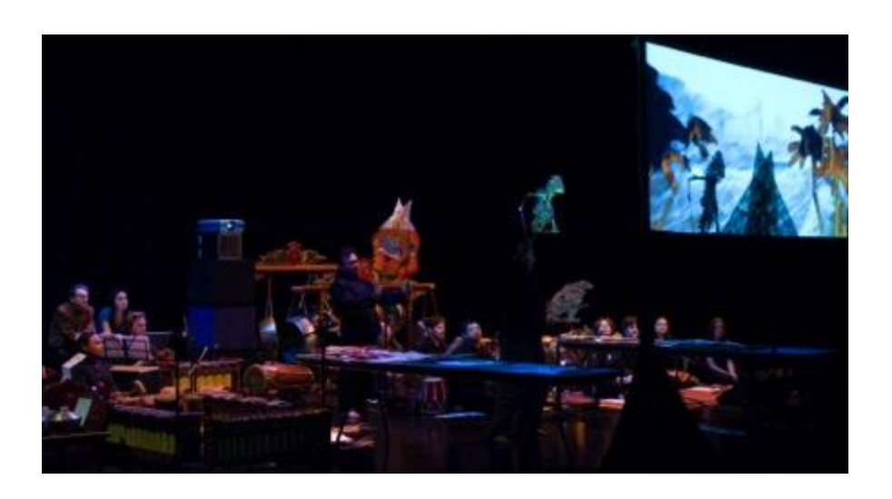
Figure 31. Semar in Lila Maya (2008)

usually move to view it from different perspectives. In the usual Indonesian staging method, the gamelan orchestra and dalang are behind the screen, but the quick movements of the dalang when changing and showing wayang puppets, their interaction with the gamelan and the vivid costumes, energetic playing and quick response of the musicians to the cues of the dalang are favourite parts of the show, but usually hidden from the view of North American seated viewers.