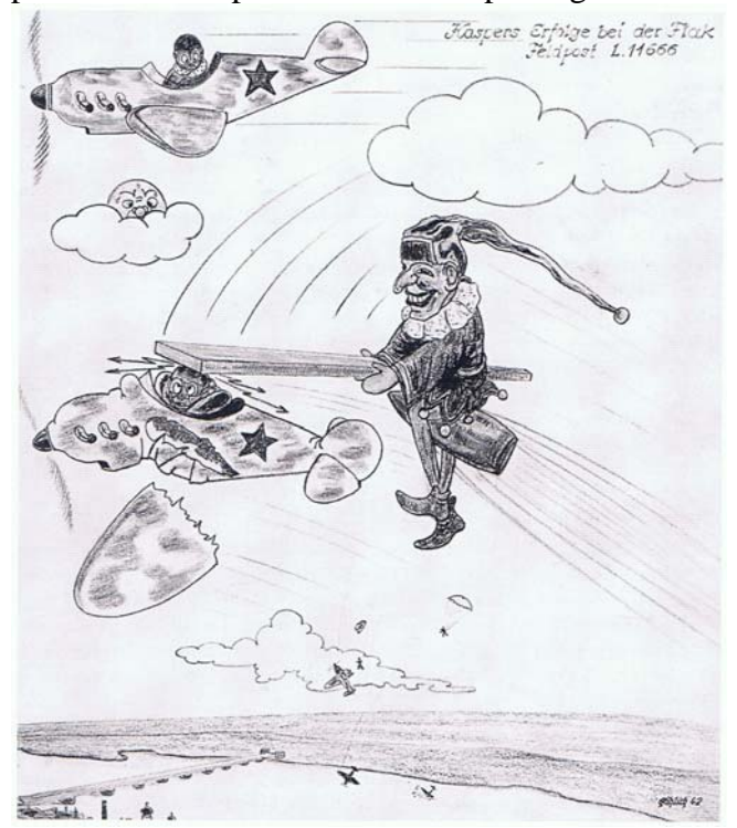
Figure 4 Kasperls Erfolg bei der Flak.

Figure 3 <u>Hohnsteiner Kasper, 1951</u>. Figure 3 is a picture of the Hohnsteiner Kasper (Kock). This was a Hand puppet and a very predominant depiction of the Kasperl figure.