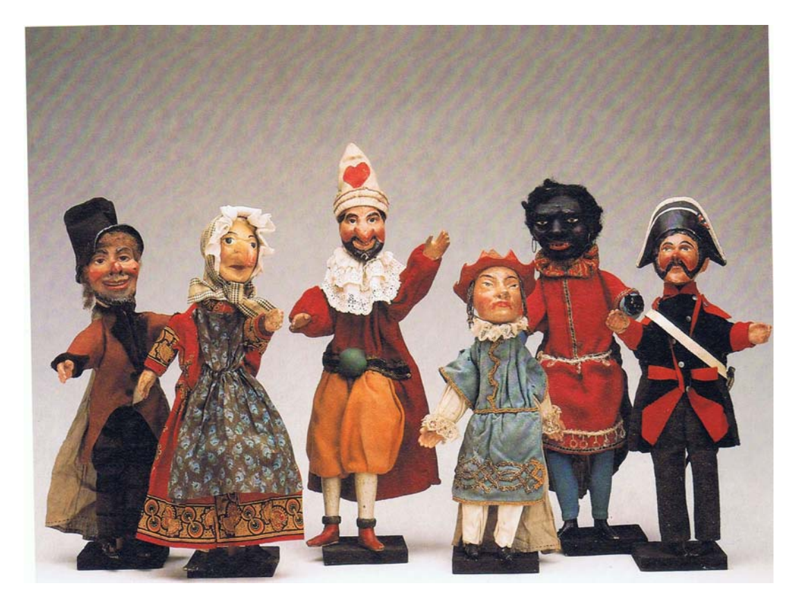
Figure 5 <u>Handfiguren aus dem Polichinell-Theater um 1860</u>.</u> Here are hand puppets from the 1860s (Handfiguren). Josef Schmid used these in performances of Pocci's <u>New Kasperl-Theatre</u> (Feuchte-Schawelka 45).