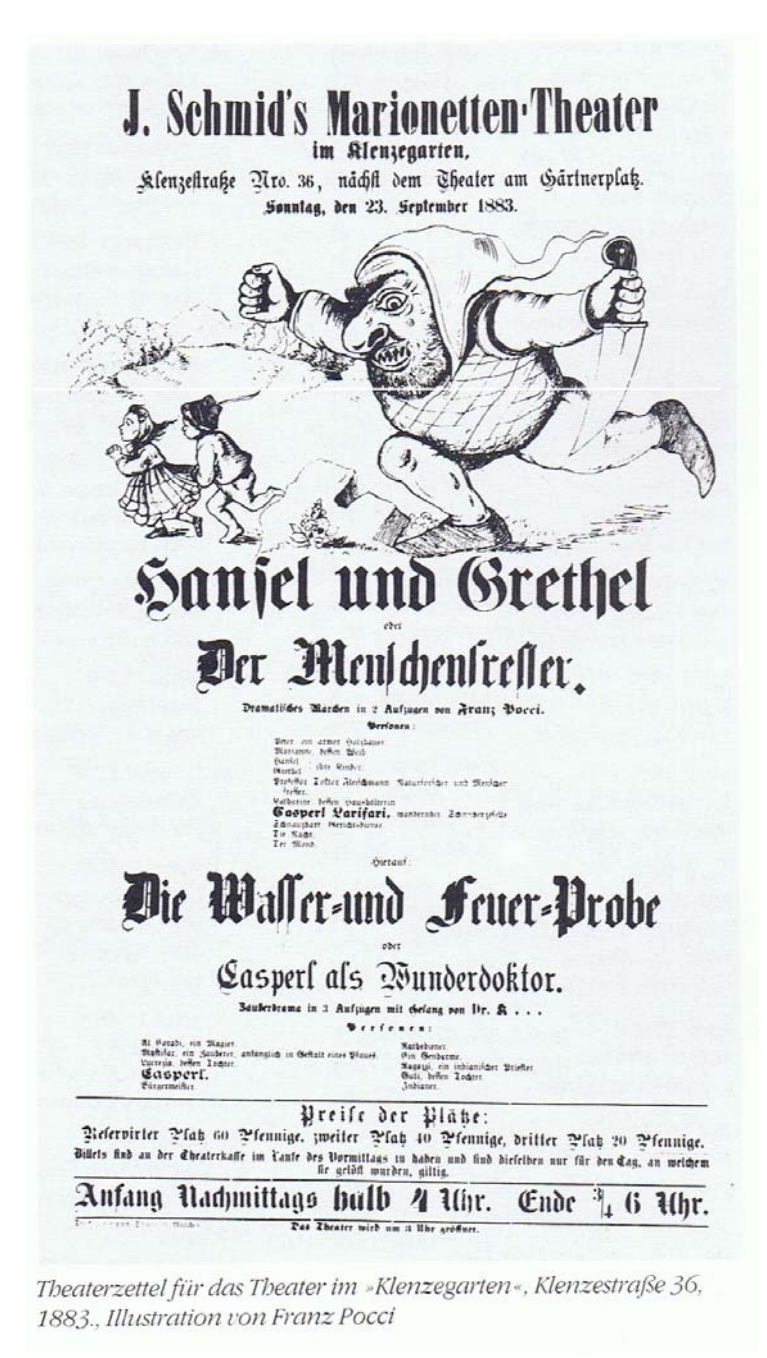
Figure 6 Theaterzettel für das Theater im »Klenzegarten«.

A poster advertising an 1888 performance of Pocci's Hansel and Gretel (Theaterzettel).